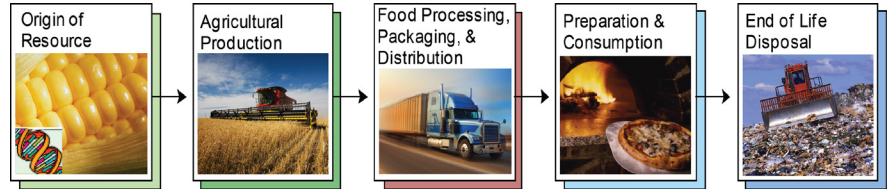
The Food System Life Cycle

Americans enjoy a diverse abundance of low-cost food, spending a mere 10% of disposable income on food. 1 However, store prices do not reflect the external costs—economic, social, and environmental—that impact the sustainability of the food system. Considering the full life cycle of the U.S. food system illuminates the connection between consumption behaviors and production practices.