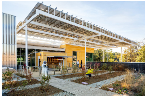
Kendeda Building for Innovative Sustainable Design, AIA COTE Top Ten Award, 2021 37